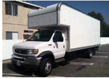
18' GALPIN SUPER CUBE box truck. Now with rear exterior work lights & back-up camera.