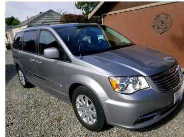
2016 Chrysler Town and Country with leather and stow-n-go seats.