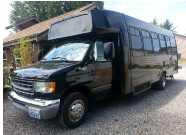
People Mover-15 person with 2 exterior restrooms, VTR and DIGI-TECH Setup W/4K GENSET, Deep cycle batteries, a 1000 Watt True Sine Wave Inverter and ladder system on exterior for attaching VTR antennas