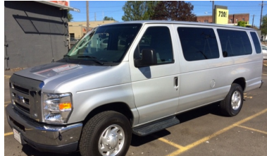
Silver 15 Pass Van w/ tinted windows and running boards