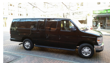
Black 15 Pass Van w/tinted windows and running boards