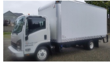
Isuzu 16' Box Trucks 1 and 2 w/liftgate. With rear exterior work lights & back-up camera.