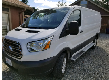
Cargo Vans 1 & 2 Inner box dimensions H:4'9" W:4'7" L:10'6"