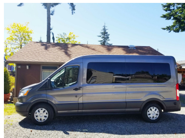
Gray 15 Pass High Top Van w/backup camera and running boards