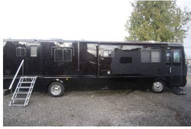
BIG Mama (39')