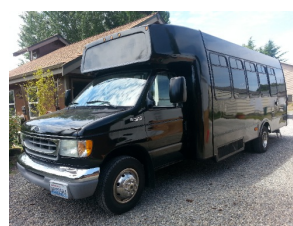
People Mover-15 person with 2 exterior restrooms, VTR and DIGI-TECH Setup W/4K GENSET, Deep cycle batteries, a 1000 Watt True Sine Wave Inverter and ladder system on exterior for attaching VTR antennas