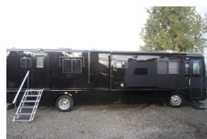
BIG Mama (39')