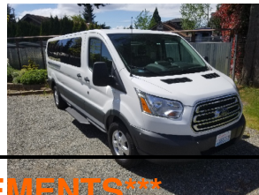
White 15 Pass Van w/tinted