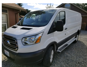
Cargo Vans 1 & 2 Inner box dimensions H:4'9" W:4'7" L:10'6"