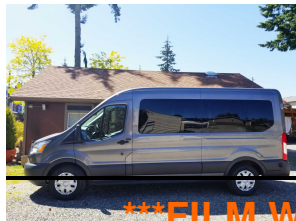
Gray 15 Pass High Top Van