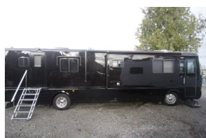
BIG Mama (39')