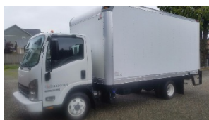
Isuzu 16' Box Trucks 1 & 2. With lift gates, rear exterior work lights & back- up cameras.