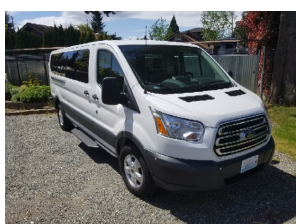
White 15 Pass Van 1 & 2 w/tinted windows, back up camera, and running boards