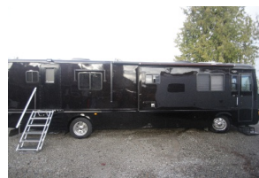
BIG Mama (39')