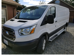
Cargo Vans 1 & 2 Inner box dimensions H:4'9" W:4'7" L:10'6"