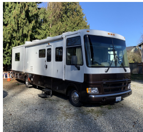
EZ Moho (38')