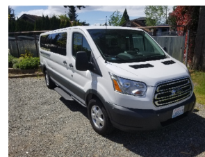
White 15 Pass Van 1 & 2 w/tinted windows, back up camera, and running boards