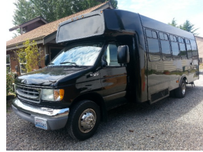
People Mover-15 person with 2 exterior restrooms, VTR and DIGI-TECH Setup W/4K GENSET, Deep cycle batteries, a 1000 Watt True Sine Wave Inverter and ladder system on exterior for attaching VTR antennas