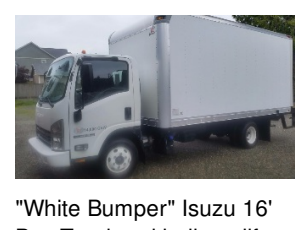
"White Bumper" Isuzu 16' Box Trucks with tilt up lift gate, rear exterior work lights, and back-up cameras.