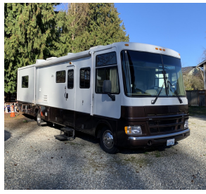
EZ Moho (38')

"Black Bumper" Isuzu 16' Box Trucks with tilt up lift gate, built in shelving, rear exterior work lights, and back-up cameras.