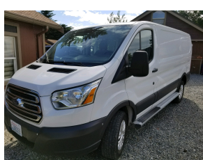
Cargo Van Inner box dimensions H:4'9" W:4'7" L:10'6"