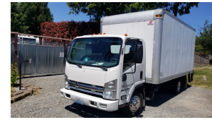
"Gray Bumper" Isuzu 16' Box Trucks with fold in gate, rear exterior work lights, and back-up cameras.

15 Passenger Van w/tinted windows, back up camera, sliding door, and running boards