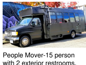
People Mover-15 person with 2 exterior restrooms, VTR and DIGI-TECH Setup W/4K GENSET, Deep cycle batteries, a 1000 Watt True Sine Wave Inverter and ladder system on exterior for attaching VTR antennas