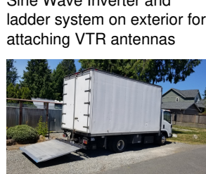
"Black Bumper" Isuzu 16' Box Trucks with tilt up lift gate, built in shelving, rear exterior work lights, and back-up cameras.