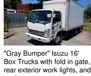
"Gray Bumper" Isuzu 16' Box Trucks with fold in gate, rear exterior work lights, and back-up cameras.

Self-Service Shipping Containers "The Nuge Cubes"