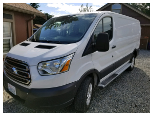
Cargo Van Inner box dimensions H:4'9" W:4'7" L:10'6"