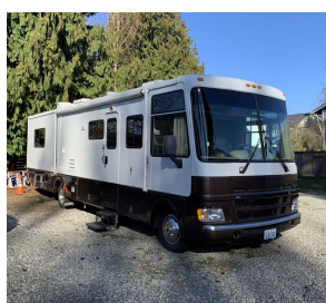
EZ Moho (38')