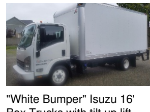
"White Bumper" Isuzu 16' Box Trucks with tilt up lift gate, rear exterior work lights, and back-up cameras.